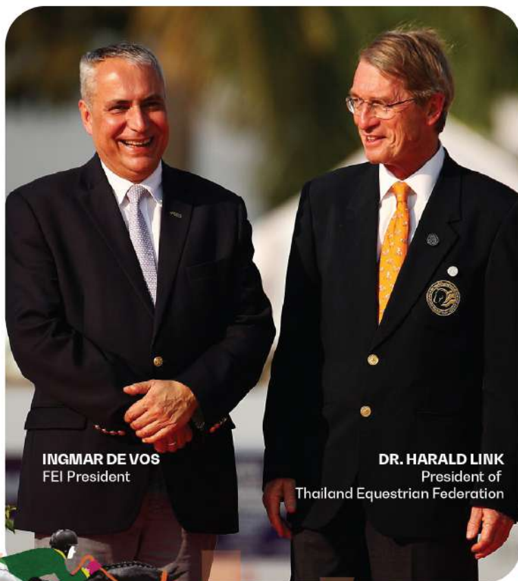
INGMAR DE VOS FEI President