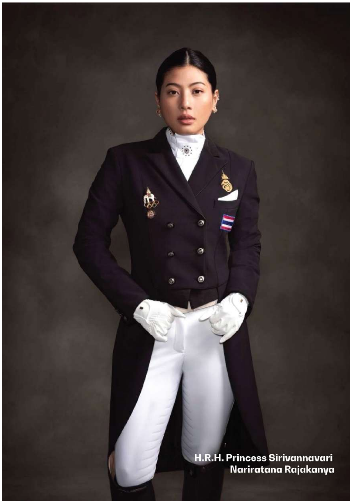
H.R.H. Princess Sirivannavari Nariratana Rajakanya